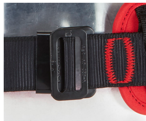
Pass through buckles