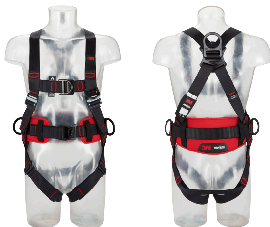
3M™ Protecta® Comfort Belt Style Fall Arrest Harness