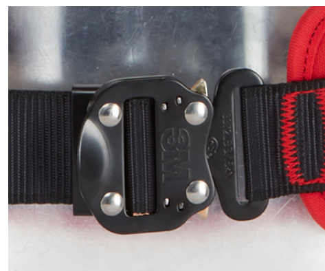
Quick connect buckles