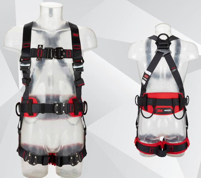
Comfort belt, horizontal leg straps