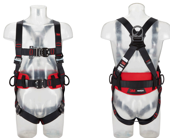
3M™ Protecta® Comfort Belt Style Fall Arrest Harness