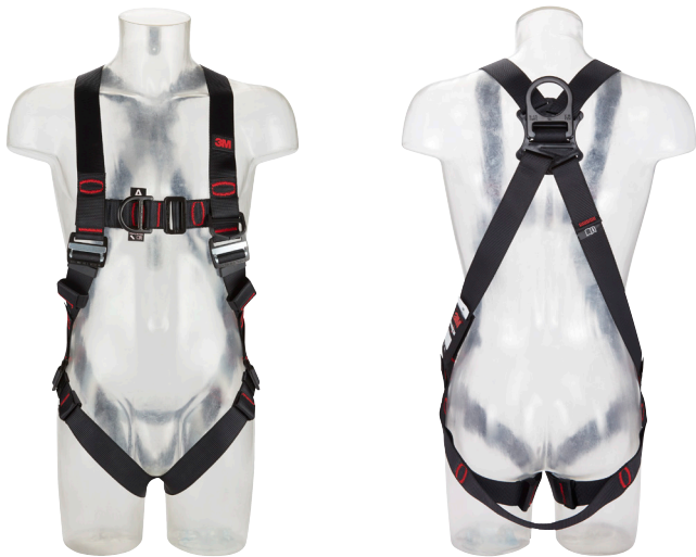
3M™ Protecta® Standard Vest Style Fall Arrest Harness