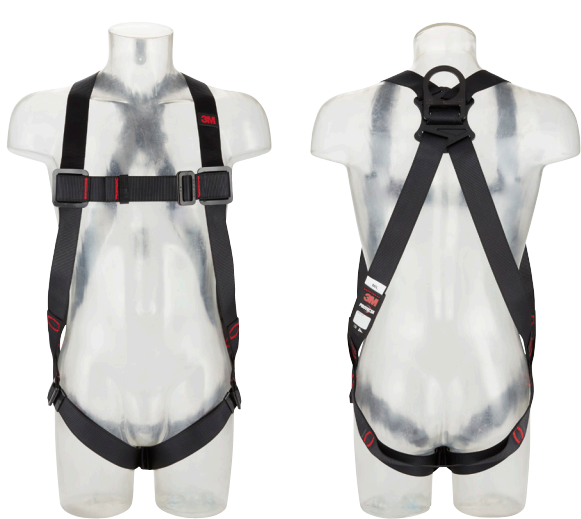
3M™ Protecta® Standard Vest Style Fall Arrest Harness