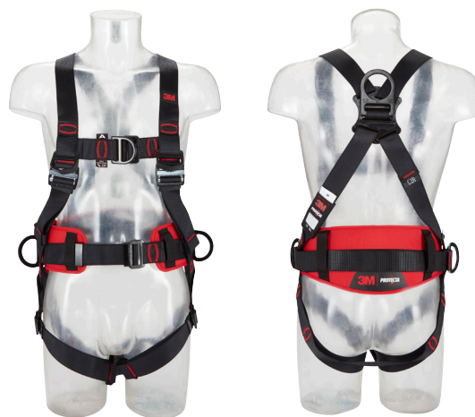
3M™ Protecta® Comfort Belt Style Fall Arrest Harness