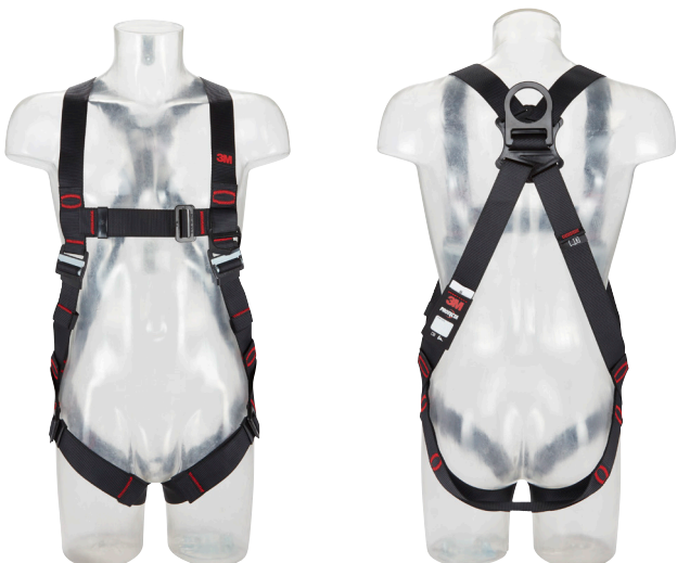
3M™ Protecta® Standard Vest Style Fall Arrest Harness