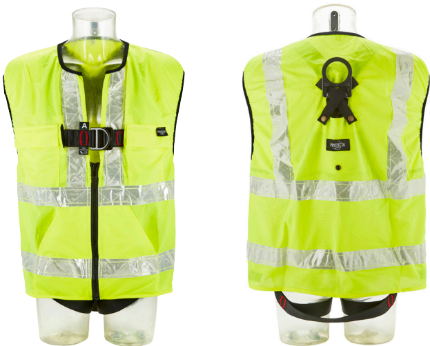
3M™ Protecta® Standard Vest Style Fall Arrest Harness with Hi-Visibility Vest