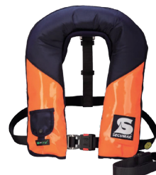
Golf 275 AS (Part Number 13805)

Compatible for use with Secumar Personal Flotation Device models: