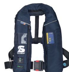
Alpha 275 AS Solas (Part Number 14824-01)