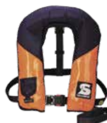
Golf 275 AS (Part Number 13805)

Compatible for use with Secumar Personal Flotation Device models: