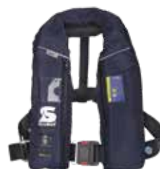
Alpha 275 AS Solas (Part Number 14824-01)