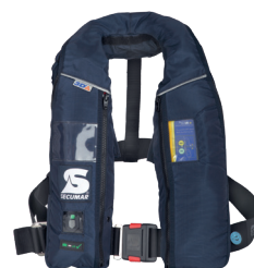
Alpha 275 AS Solas (Part Number 14824-01)