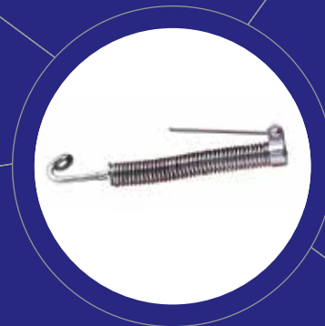
3M™ Forsus™ Class II Correctors