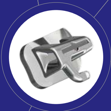
3M™ Victory Series™ Superior Fit Buccal Tubes