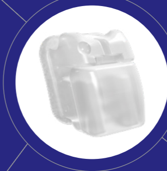
3M™ Clarity Ultra™ Self-Ligating Brackets