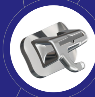
3M™ Victory Series™ Superior Fit Buccal Tubes