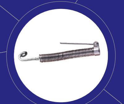
3M™ Forsus™ Class II Correctors