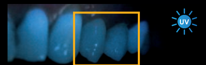
Under UV light