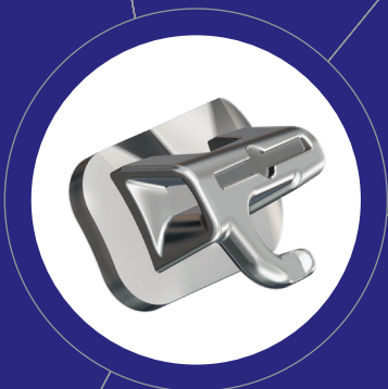
3M™ Victory Series™ Superior Fit Buccal Tubes