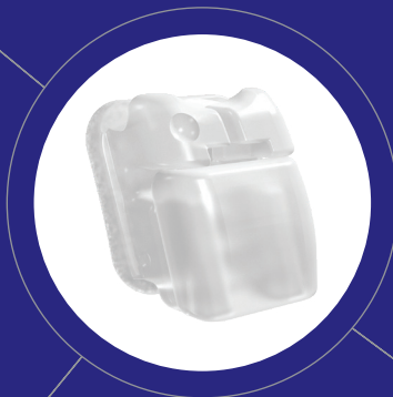
3M™ Clarity Ultra™ Self-Ligating Brackets