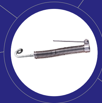
3M™ Forsus™ Class II Correctors