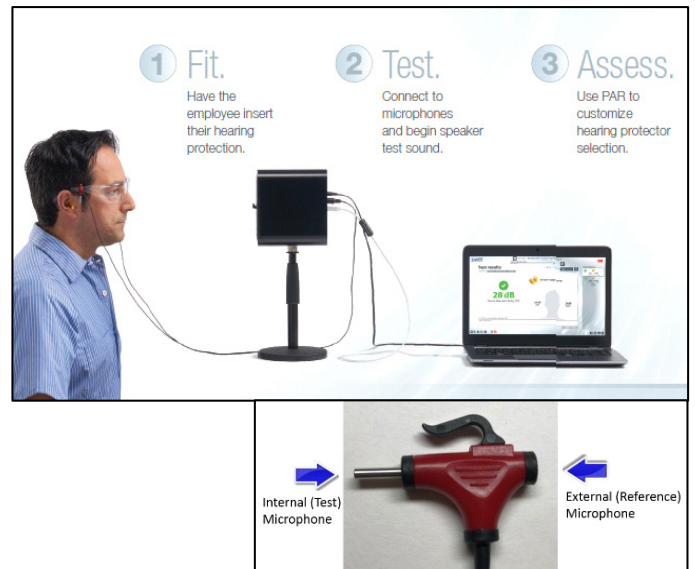
Figure 3. 3M™ E-A-Rfit™

There are a variety of FAES technologies available on the market. The 3M™ E-A-Rfit™ Dual-Ear Validation System is based on field microphone-in-real ear (F-MIRE) technology. The system consists of a specially designed loudspeaker equipped with a digital signal processor that allows for a consistent presentation of the test signal and real-time communication between the microphones, speaker and software (see Figure 3). The dual-element microphone assembly attaches to specially probed hearing protectors to allow measurement of the sound level inside the test subject's ear canal while the hearing protector is worn. The "in-ear" sound level is simultaneously compared to the sound level just outside the hearing protector, as measured by the external microphone. The measured difference between the internal and external sound levels represents the noise attenuation in decibels.