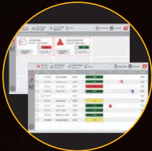
3M™ Scott™ Monitor Telemetry Software Solution With Pro Package