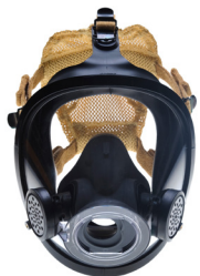
AV-3000 SureSeal Kevlar® Head Harness