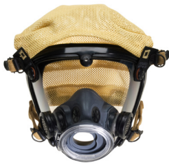
AV-2000 Kevlar Head Harness