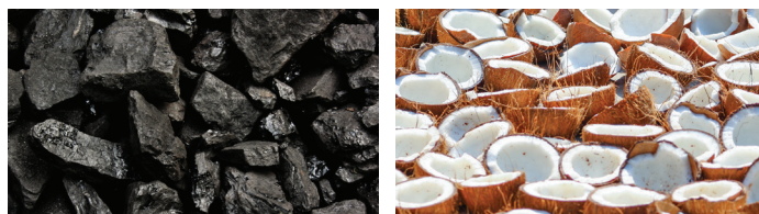
Coal or renewable resources, such as coconut shells

3M is committed to develop high-quality safety products to help protect workers. For more information about 3M gas and vapour cartridges, or to establish a cartridge change schedule, visit 3M.ca/RespiratoryProtection .