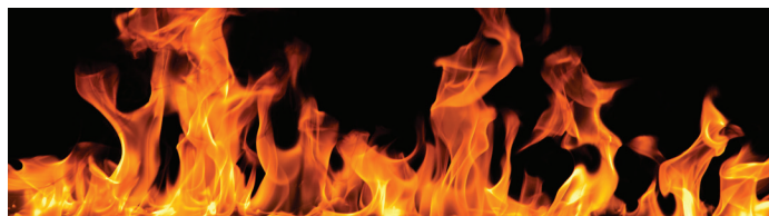
Coal or renewable resources are heated without oxygen