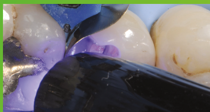
Fig. 5: After air drying for approximately 5 seconds, the adhesive is light cured for 10 seconds with 3M™ Elipar™ DeepCure-S LED Curing Light.