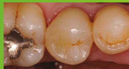
Fig. 9: Final restoration is very natural-looking and aesthetic.