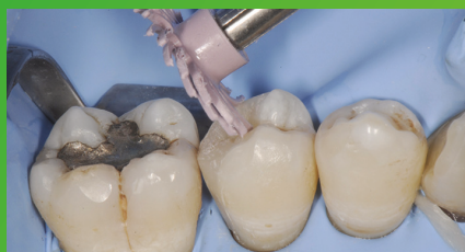
Fig. 8: A final high-gloss polish is created using the 3M™ Sof-Lex™ Diamond Polishing Spiral on a moist surface.