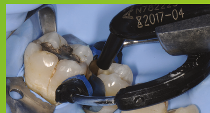
Fig. 6: 3M™ Filtek™ One Bulk Fill Restorative, in shade A3, is directly placed into the cavity in a single increment and then cured according to the Instructions for Use.