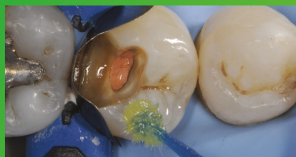
Fig. 4: 3M™ Scotchbond™ Universal Adhesive is applied and scrubbed into the surface for 20 seconds.