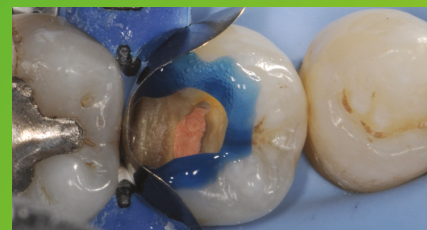
Fig. 3: Enamel is etched for 15 seconds using 3M™ Scotchbond™ Universal Etchant for a selective etch approach, followed by rinsing and drying.