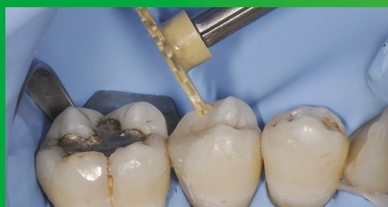
Fig. 7: Following finishing, to achieve the final polish of the restoration, the 3M™ Sof-Lex™ Pre-Polishing Spiral is used, as a first step, on a moist surface.