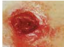
Peristomal Skin Damage