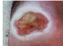
Periwound Skin Damage