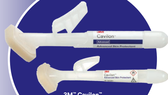
3M™ Cavilon™ Advanced Skin Protectant