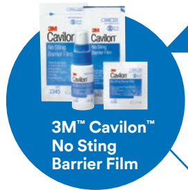
3M™ Cavilon™ No Sting Barrier Film

Protect intact skin from moisture, friction or shear