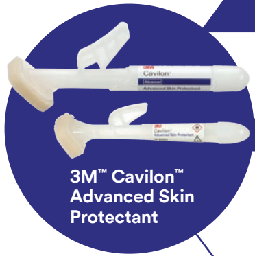
3M™ Cavilon™ Advanced Skin Protectant