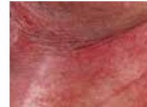
Intertriginous Dermatitis (ITD)