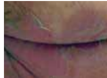
Incontinence-Associated Dermatitis (IAD)