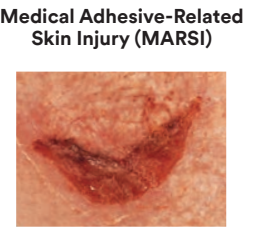
Medical Adhesive-Related Skin Injury (MARS)