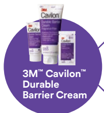
3M™ Cavilon™ Durable Barrier Cream

Protect intact skin from adhesive products (e.g. tape, wound and vascular access dressings and ostomy products)