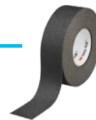
3M™ Safety-Walk™ Slip-Resistant General Purpose Tread