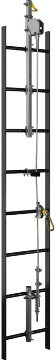
Rung, 4 User, Galvanized Steel - 6116633