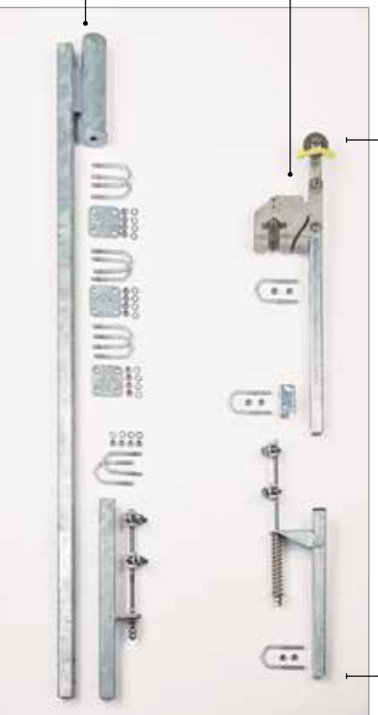
New Generation System

Light Total system weighs less than our previous 2- and 4-user systems.