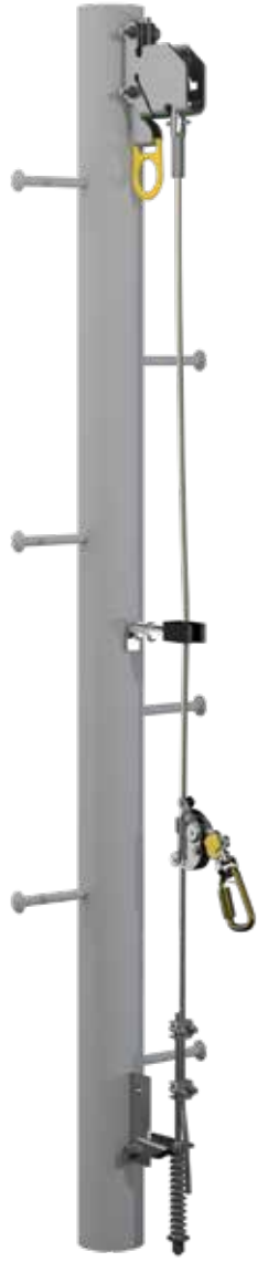
Monopole, 4 User, Galvanized Steel - 6116634 Monopole, 4 User, Stainless Steel - 6116638