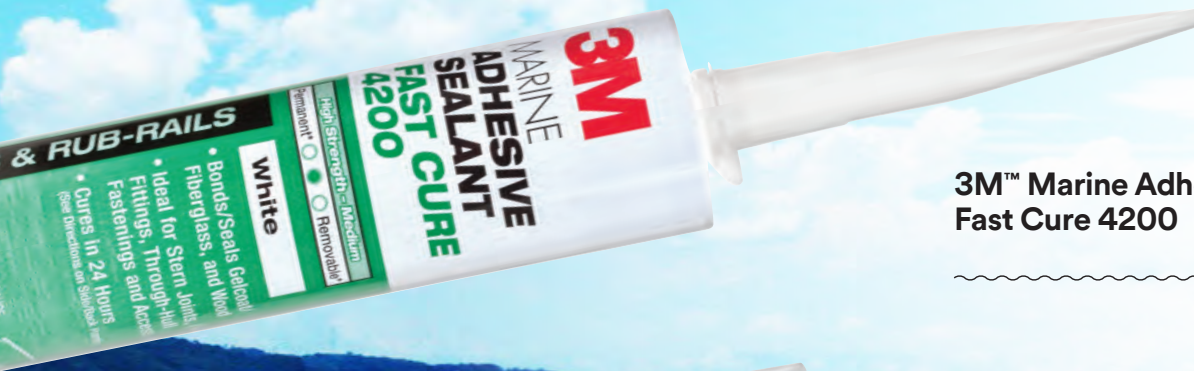
3M™ Marine Adhesive Sealant Fast Cure 4200