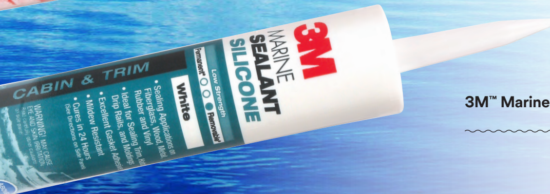
3M™ Marine Grade Silicone Sealant