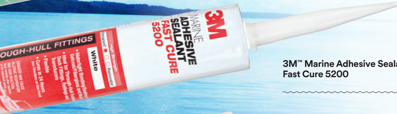
3M™ Marine Adhesive Sealant Fast Cure 5200