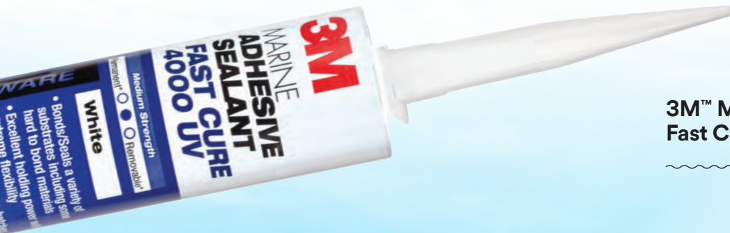
3M™ Marine Adhesive Sealant Fast Cure 4000 UV