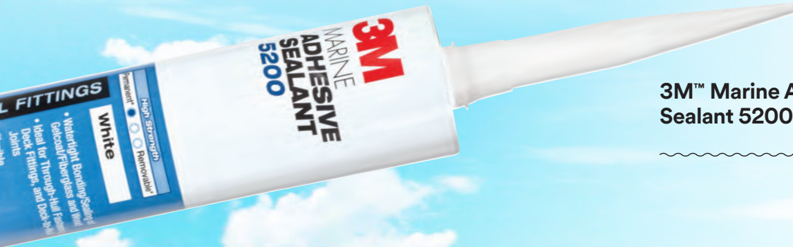
3M™ Marine Adhesive Sealant 5200