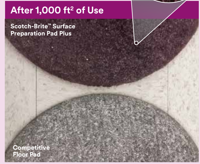
Caked on finish and dirt can interfere with floor pad performance.