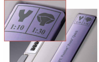
Product name and working/setting times are visible, even when the device cover is closed.