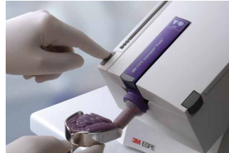
Push buttons on left and right side allow for easy operation.