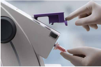
Easy to attach mixing tip without opening device cover.

The 3M™ Pentamix™ 3 Automatic Mixing Unit operates with push buttons on either side. This makes it easy to use whether you are right- or left-handed. Effortless cartridge exchange and easy-to-attach mixing tips also increase procedure efficiency.