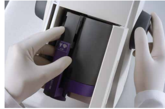
Easy cartridge exchange.