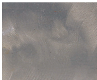
3M™ Cavity Wax Plus 08852 (3 coats)

Learn more about our complete system of body repair solutions at www.3M.co.uk/bodyshop