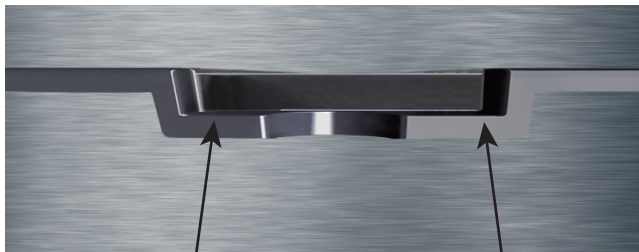
Flat pocket bottom