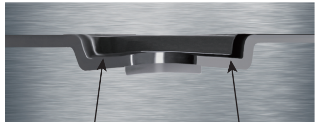
Curved pocket bottom