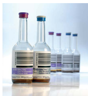
BD BACTEC Blood Culture Media Offering

of vascular-access catheter entry. Beyond that, broader education on symptoms of sepsis can enable a quicker process to diagnosis and treatment. Methods to provide earlier diagnosis of sepsis are under development and will represent a major advancement when they become available clinically."