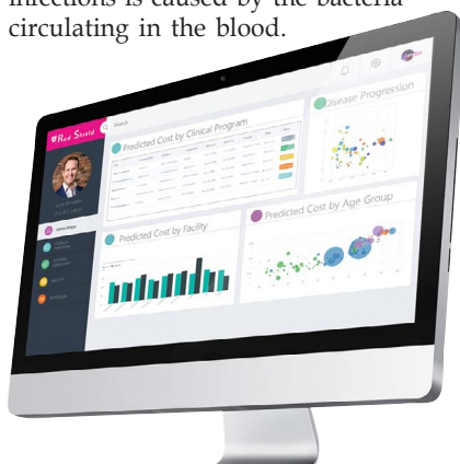
KenSci’s SaaS platform integrates data across EMR, claims, and digital health data.