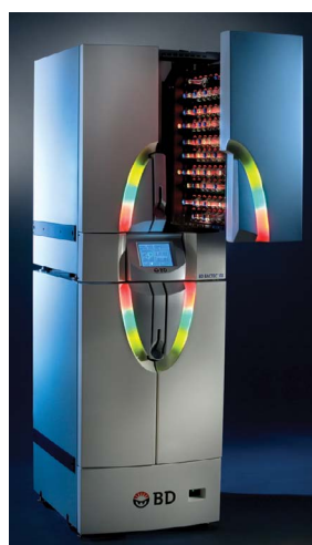
BD BACTEC FX Series Automated Blood Culture Instrument

Parks, 3M, also looks toward advances in technology, as well as increased education on sepsis. "Preventing sepsis will rely on integrating more advanced technology upstream, in an effort to diminish the occurrence of sepsis at the source. This includes protecting all points