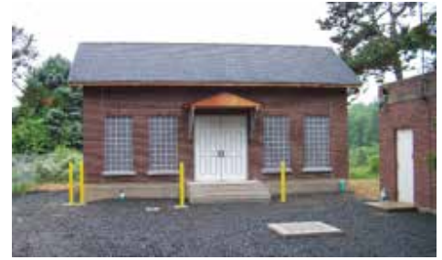
A building erected around the Liqui-Cel membrane contactor system. This installation is in a residential area, so it was important to conceal equipment in an aesthetically pleasing manner.