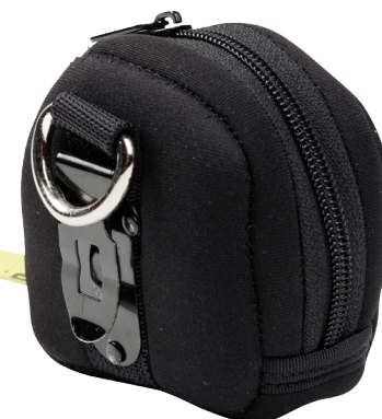
#1500165 Large Tape Measure Sleeve (For most up to 35 ft.)