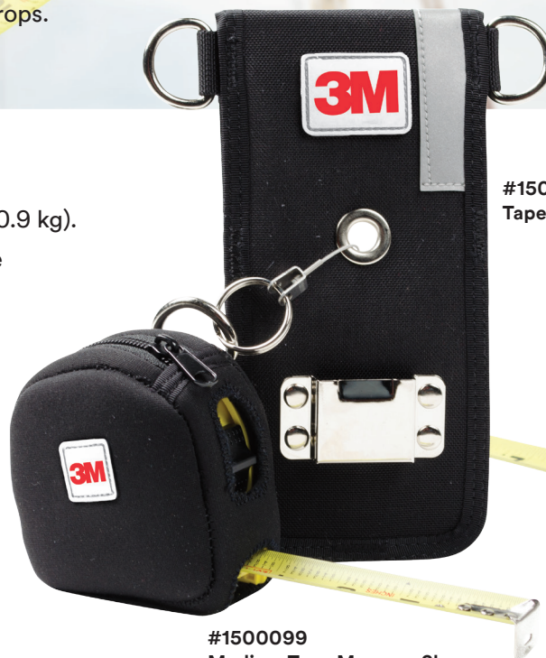
#1500099 Medium Tape Measure Sleeve (For most up to 25 ft.)