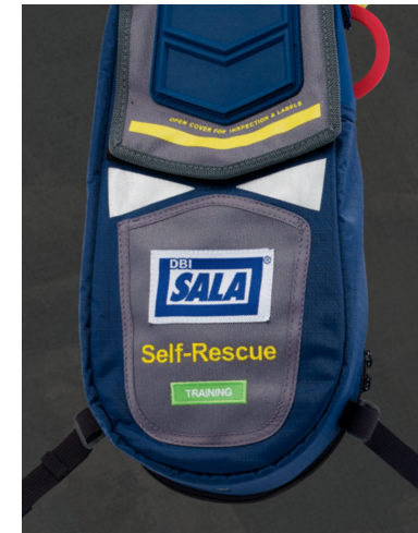
3M™ DBI-SALA® Self-Rescue Training Device

This 30-foot trainer device simulates a realistic fall rescue experience, allowing you to educate your team on the use of the product. It's easy to rewind the rope on-site, so you can train your team up to 20 times before recertification of the device will be required.