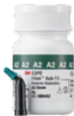
Filtek™ Bulk Fill Posterior Restorative

And, it helps you deliver predictable, robust outcomes. All you need is the new RelyX™ Fiber Post 3D Glass Fiber Post plus three other easy-to-use 3M products: RelyX™ Unicem 2 Automix Cement, Scotchbond™ Universal Adhesive, and Filtek™ Bulk Fill Posterior Restorative. These four products have one common objective: Simplify the complex!