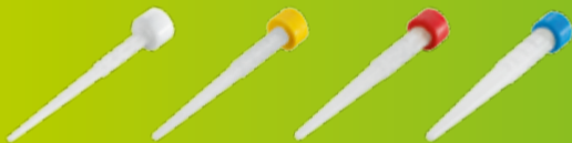
RelyX™ Fiber Post 3D Glass Fiber Post