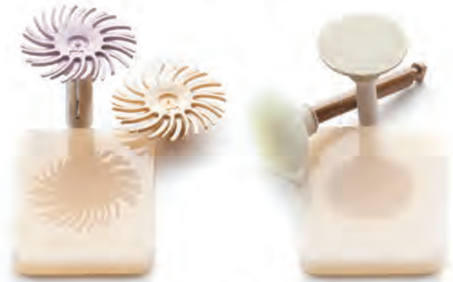
Filtek™ Supreme XTE Universal Restorative polished with Sof-Lex™ Diamond Polishing System (left) vs a competitor composite polished with their finishing and polishing paste system. Notice a clearer reflection with the Sof-Lex™ Diamond Polishing System.