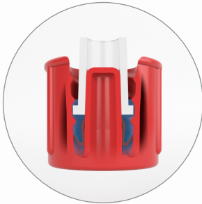
Uses 70% IPA to disinfect critical surfaces.

Just peel the foil from the disinfecting cap and push and twist the cap on to the end of the stopcock.