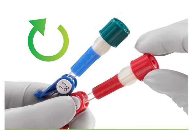
Push & Twist on catheter hub