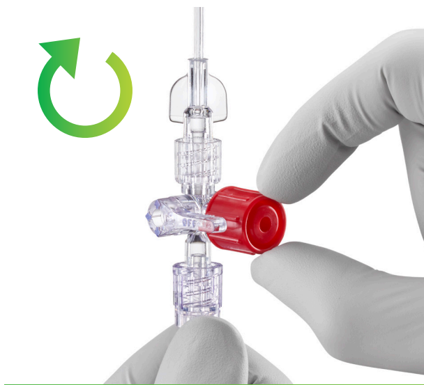
Push & Twist on stopcock