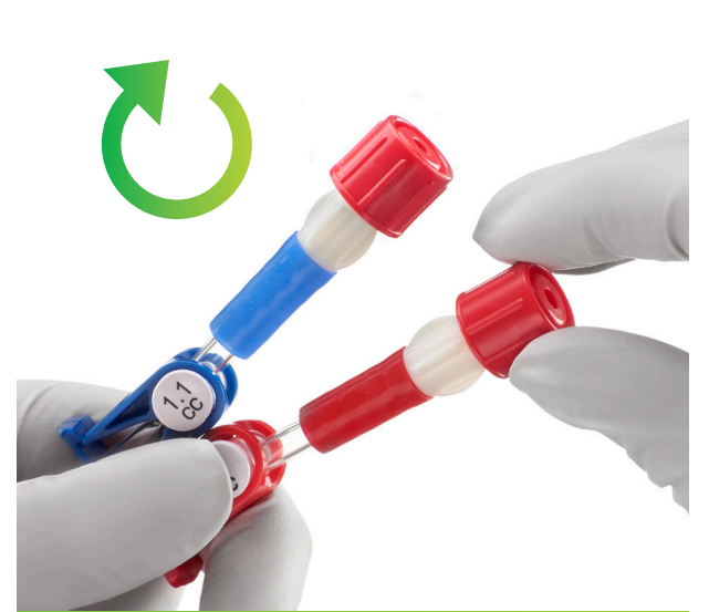
Push & Twist on catheter hub