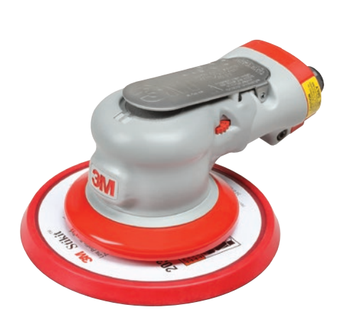
3M<sup>™</sup> Elite Non-Vacuum Random Orbital Sander