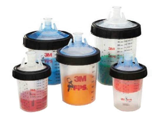
3M<sup>™</sup> PPS<sup>™</sup> Paint Preparation System