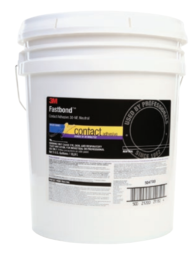
3M<sup>™</sup> Fastbond<sup>™</sup> Contact Adhesive 30NF