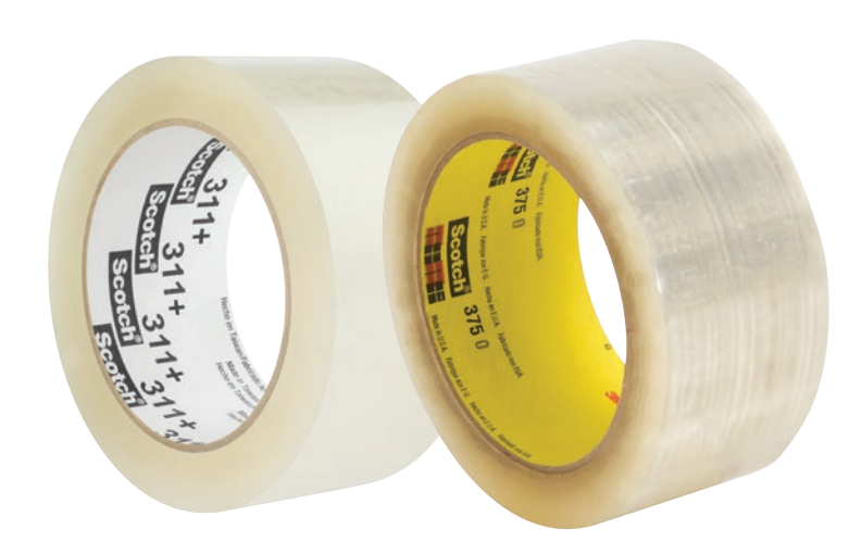
Scotch® Box Sealing Tape 311+, 375