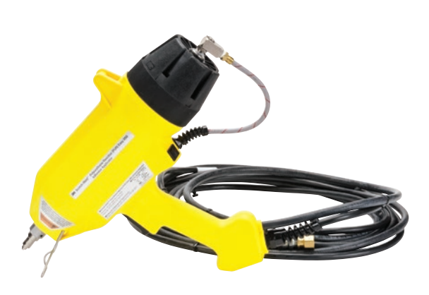
3M<sup>™</sup> Scotch-Weld<sup>™</sup> PUR Easy 250 Applicator