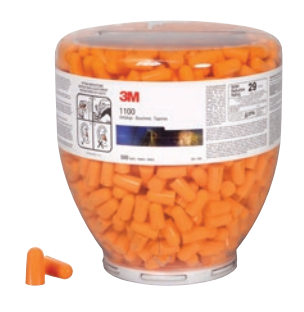
3M<sup>™</sup> Foam Earplugs 1100