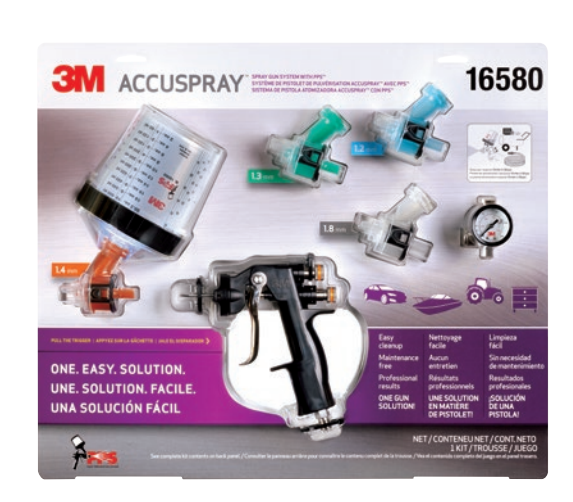
3M<sup>™</sup> Accuspray<sup>™</sup> ONE Spray Gun System with PPS<sup>™</sup>