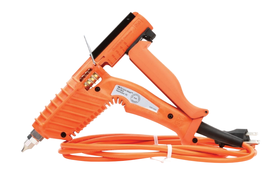
3M<sup>™</sup> Hot Melt Applicator TC with Quadrack Converter