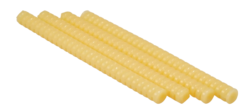
3M<sup>™</sup> Hot Melt Adhesive 3762