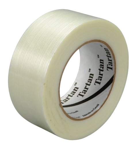
Tartan<sup>™</sup> Filament Tape 8934