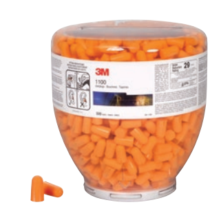
3M<sup>™</sup> Foam Earplugs 1100