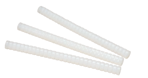
3M<sup>™</sup> Hot Melt Adhesive 3792