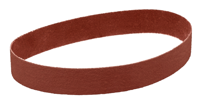
3M<sup>™</sup> Cloth Belt 370DZ