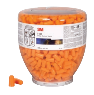
3M<sup>™</sup> Foam Earplugs 1100