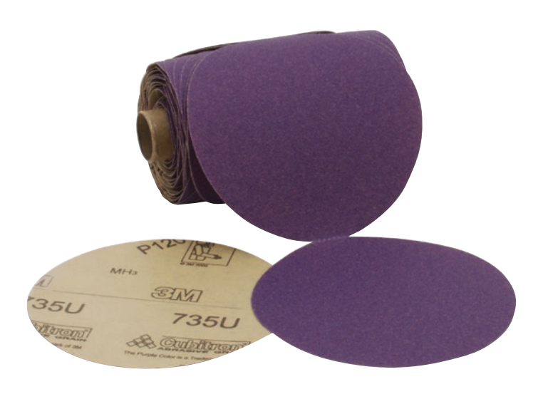
3M<sup>™</sup> Stikit<sup>™</sup> and Hookit<sup>™</sup> Discs 735U