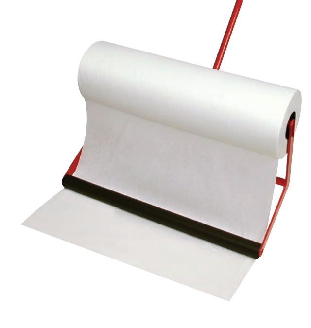
3M<sup>™</sup> Dirt Trap Paint Booth, Floor and Surface Protection Material