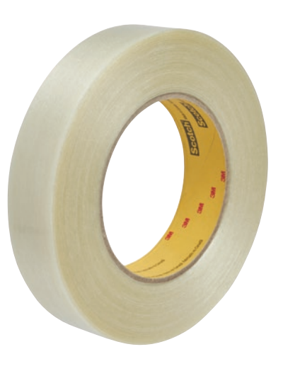
Scotch® Filament Tape 898