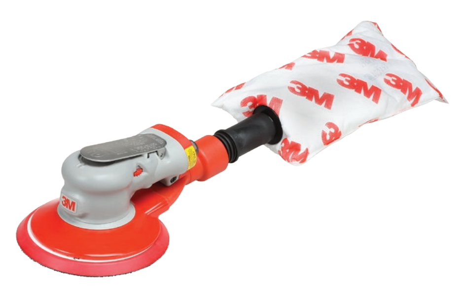
3M<sup>™</sup> Elite Self-Generated Vacuum Random Orbital Sander