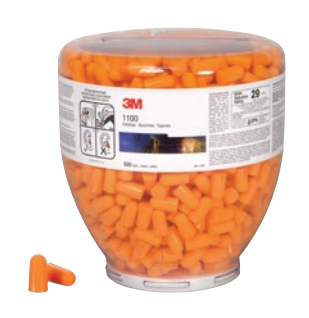
3M<sup>™</sup> Foam Earplugs 1100