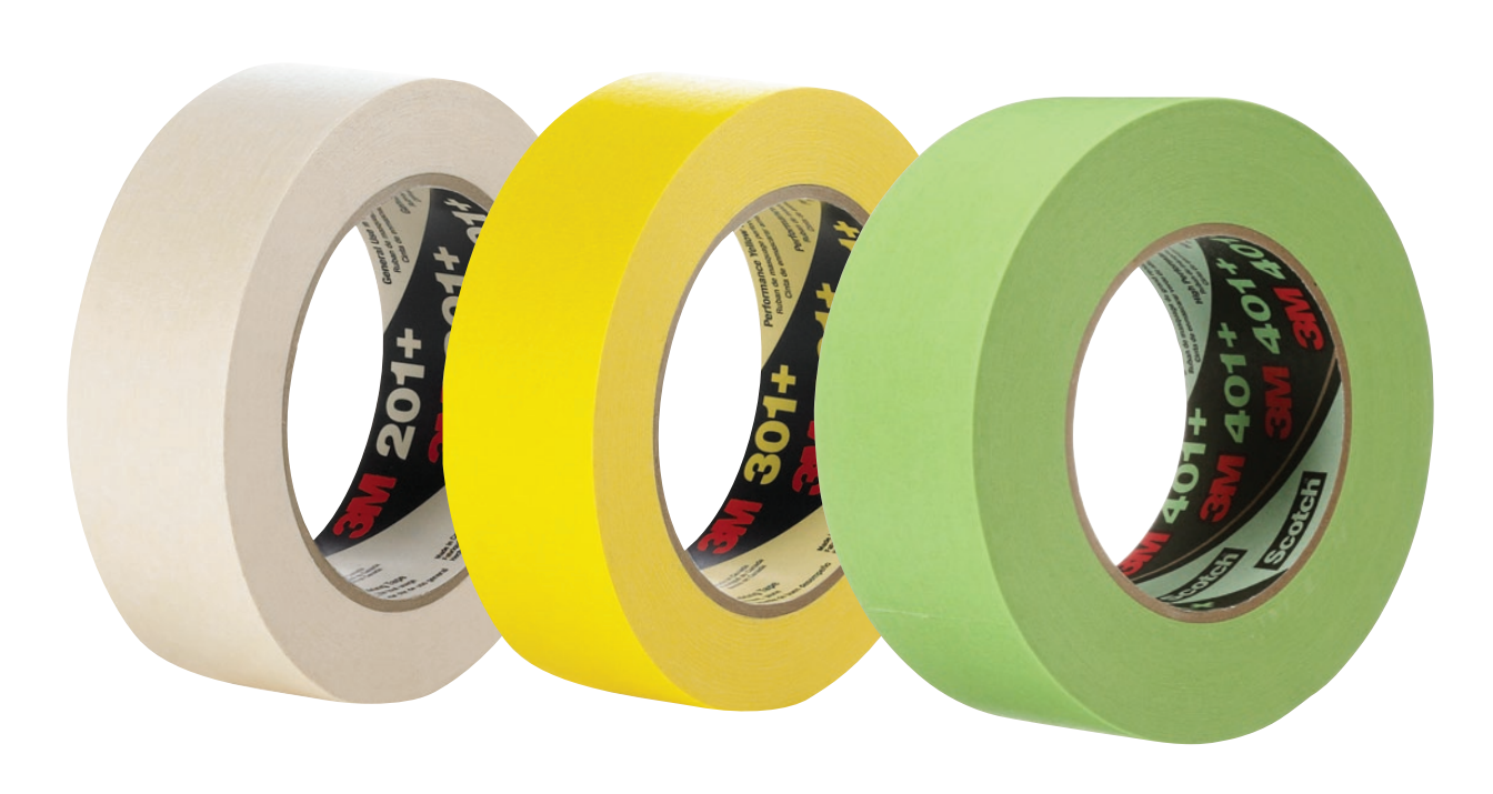
3M<sup>™</sup> Masking Tape 201+, 301+, 401+