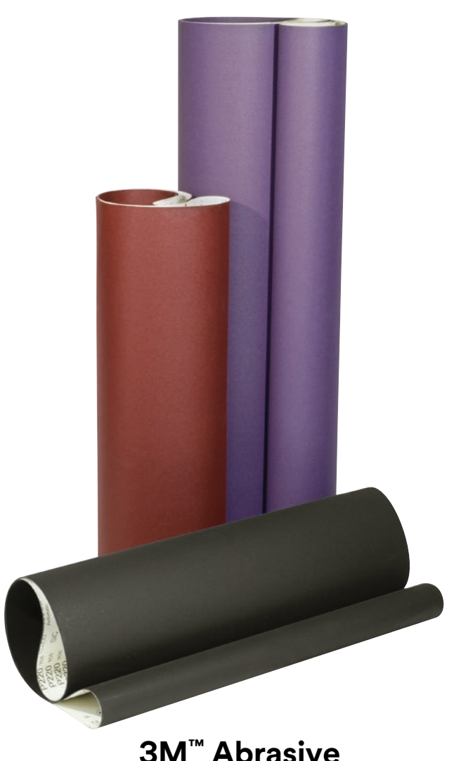
3M<sup>™</sup> Abrasive Wide Belts