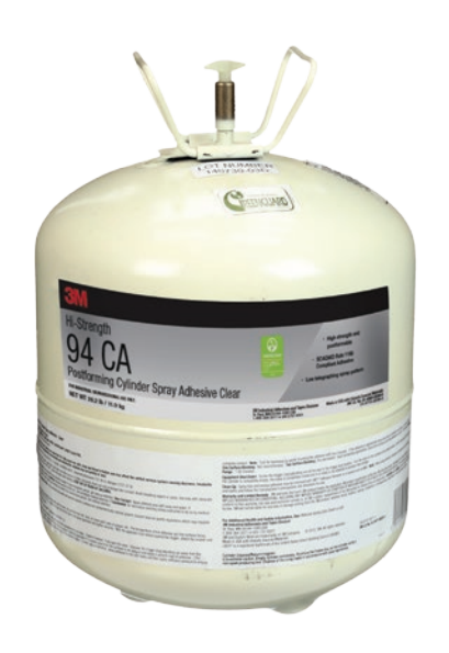
3M<sup>™</sup> Hi-Strength 94 CA Cylinder Spray Adhesive