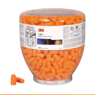
3M<sup>™</sup> Foam Earplugs 1100