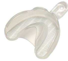
Figure 4. 3M™ Impression Tray

The 3M intra-oral syringe is loaded with the appropriate amount of Imprint™ 4 Light (Figure 5). The syringes are single use, ergonomically designed, and can be prepared in advance (Figures 6-7). The syringe is designed for the loading of consistent amounts of wash for both single and multiple preps. There are markings and characteristics on the syringe that will accommodate specific amounts. Using the syringe is much easier than trying to guide the 3M™ Garant™ cartridge with extended mixing tips. The 3M intra-oral syringe uses less material and allows more accurate placement.