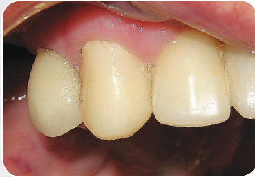
Figure 11. Temporary crown.