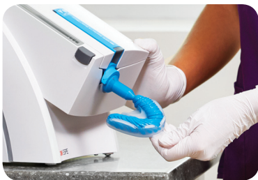
Figure 8. Loading 3M™ Imprint™ 4 material into the 3M™ Impression Tray using a 3M™ Pentamix™ 3 Automatic Mixing Unit .