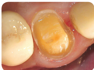
Figure 1. Prepared tooth #6.

Initial impressions were obtained including a template for temporary fabrication, a study model and an opposing full arch mandibular impression (using 3M impression tray). After placing local anesthetic, the tooth was prepped for a full porcelain crown (Figure 1). Prior to the final impression, 3M retraction capsule (3M) paste was injected into the sulcus of tooth #6 (Figure 2). The retraction paste contains 15% aluminum chloride and is intended to provide temporary tissue retraction and enable a clean, dry and controlled sulcus. 3M retraction capsule paste material can be used alone or in conjunction with retraction cord. The soft and narrow tip of the 3M retraction capsule corresponds in size and shape to a periodontal probe; designed for direct placement in the sulcus (Figure 3).