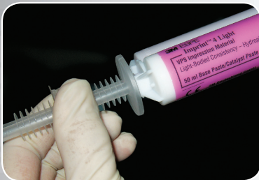
Figure 5. 3M™ Intra-oral Syringe connects easily to a cartridge.