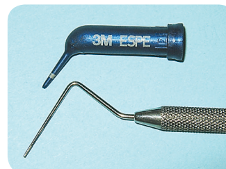
Figure 3. 3M™ Retraction Capsule and periodontal probe tips are similar in size.