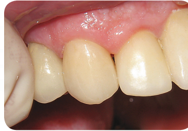
Figure 12. Final restoration.

A temporary crown (Figure 11) is fabricated using the pre-prep impression template. The Imprint 4 impression and models were sent to the lab where an all porcelain crown was fabricated.