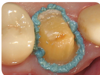
Figure 2. 3M retraction paste in place around preparation.