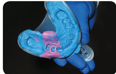
Figure 9. Full-arch final impression.