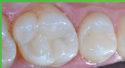
Fig. 8: Final restoration is very natural-looking and esthetic.