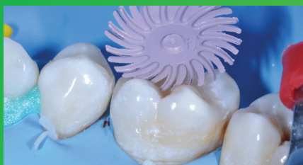
Fig. 7: After using the 3M™ Sof-Lex™ Pre-Polishing Spiral, a final high-gloss polish is created using the 3M™ Sof-Lex™ Diamond Polishing Spiral on a moist surface.