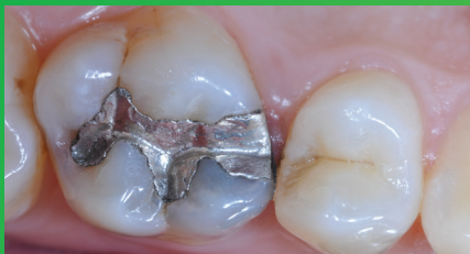
Fig. 1: Initial Situation: Replacement of an insufficient amalgam restoration of first upper molar and treatment of carious lesion on premolar. Patient was experiencing pain.