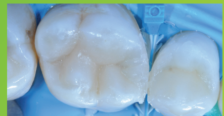
Fig. 6: 3M™ Filtek™ One Bulk Fill Restorative following contouring and finishing.