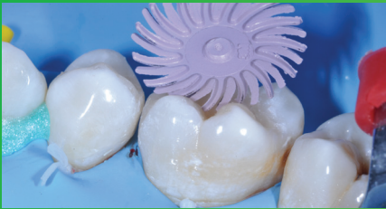
Fig. 7: After using the 3M™ Sof-Lex™ Pre-Polishing Spiral, a final high-gloss polish is created using the 3M™ Sof-Lex™ Diamond Polishing Spiral on a moist surface.