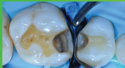
Fig. 2: Amalgam and carious tissue removed. Placement and adaptation of the sectional matrix.