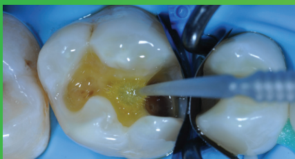
Fig. 4: 3M™ Scotchbond™ Universal Adhesive is applied and scrubbed into the surface for 20 seconds. After air drying for approximately 5 seconds, the adhesive is light cured for 10 seconds with 3M™ Elipar™ DeepCure-S LED Curing Light.