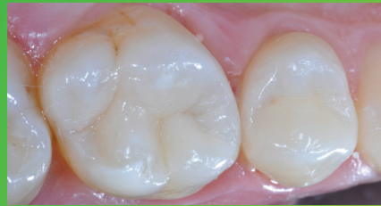
Fig. 8: Final restoration is very natural-looking and esthetic.