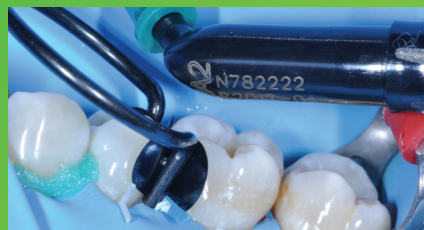
Fig. 5: 3M™ Filtek™ One Bulk Fill Restorative, in shade A2, is directly placed into the cavity in a single increment and then cured according to the Instructions for Use.