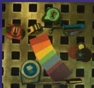
9002NC ADF Shade 3

Improved optics in the Speedglas 9002NC welding filter helps you see your welds in a new light, providing more contrast and natural-looking color as shown in these photos.