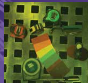
Sample Competitor ADF Shade 3