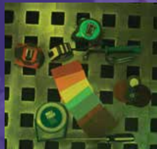
9000X ADF Shade 3