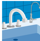
AP Easy Complete