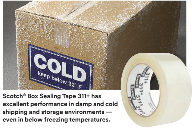
Scotch® Box Sealing Tape 311+ has excellent performance in damp and cold shipping and storage environments — even in below freezing temperatures.