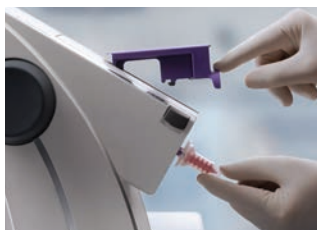
Easy to attach mixing tip without opening device cover.

The 3M™ Pentamix™ 3 Automatic Mixing Unit operates with push-button from either side. This makes it easy to use whether you are right- or left-handed. Effortless cartridge exchange and easy-to-attach mixing tips also increase procedure efficiency.