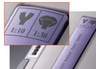
Product name and working/setting times are visible, even when the device cover is closed.