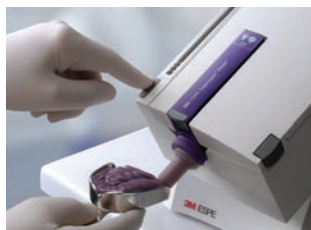
Push-buttons on left and right side allow for easy operation.