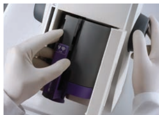
Easy cartridge exchange.