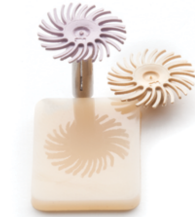
Filtek™ Supreme XTE Universal Restorative polished with Sof-Lex™ Diamond Polishing System providing a clear reflection due to the high gloss finished obtained.

You'll find it reassuring to know that you no longer need to stop and switch between traditional points, cups, discs and brushes. The flexible spirals adapt to all tooth surfaces—anterior and posterior, convex and concave. They can be sterilised and reused (refer to IFU), making them an economical choice for your practice.