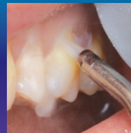
Around gingival margins