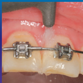
Around orthodontic brackets

Clinpro™ Glycine Prophy Powder from 3M is a gentle prophy powder that has the longest clinical history of glycine air-polishing powders—used clinically since 2001.