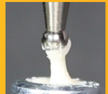
GC Fuji IX GP® Caps