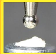
Ketac™ Universal Aplicap™ Glass Ionomer Restorative

As proof, a laboratory test was performed. A metal ball plunger was dipped into the mixed paste of each restorative material and withdrawn immediately. Test photos show that Ketac™ Universal Aplicap™ Glass Ionomer Restorative did not stick to the metal ball, while the other glass ionomer materials tested displayed a clear “pull back”—or stickiness—when the ball plunger was lifted. 1