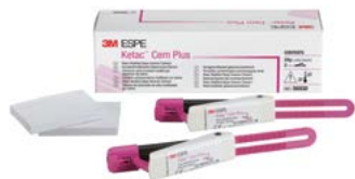
Ketac™ Cem Plus Clicker™ Refill