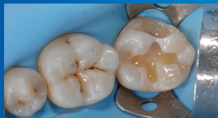
Fig. 5: Filtek™ Ultimate Flowable Restorative, shade A3 was used as a liner for easy adaptation.