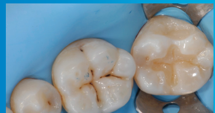
Fig. 6: Dentin was replaced with incremental placement and curing of Filtek™ Ultimate Universal Restorative, shade A3B.