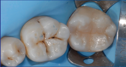
Fig. 7: Enamel was replaced with Filtek™ Ultimate Universal Restorative, shade A3E and light cured. Stains were applied in the fissure.