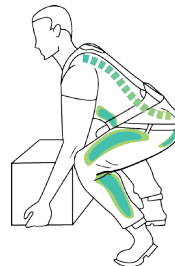
Diagram of proper lifting posture with ErgoSkeleton™

Customer feedback surveys have documented a reduction in pain and fatigue, after a full day's use of FLx postural support devices.