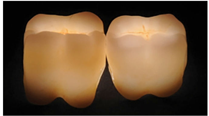
Fig. 3: The optical properties of Lava™ Plus High Translucency Zirconia.

The unique technology used in the Lava Plus zirconia Dyeing Liquids helps preserve the translucency after shading without compromising strength, because the color ions become part of the crystalline structure. When light enters, it interacts with the color ions, resulting in a warm, natural intrinsic shade coming from “inside” the depth of the restoration (Figure 3). If the coloration were simply “stained and glazed” on the outside, it could wear down over time and lose the properties that create great-looking restorations.