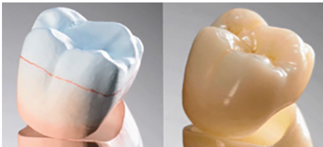
Fig. 2: An unsintered Lava™ Plus High Translucency Zirconia restoration with Lava™ Plus High Translucency Dyeing Liquids applied (left). The final restoration (right).

To get the warm, translucent appearance of natural dentition, Lava™ Plus High Translucency Dyeing Liquids and Enamel Shades are applied to the pre-sintered restoration after the milling step. Because of their advanced chemical makeup, the color ions in the Dyeing Liquids actually become incorporated directly into the zirconia crystals during the sintering process. The liquids contain a finely tuned mixture of soluble gray, pink or yellow color ions in perfect proportions needed to achieve the desired VITA® classical shades. Special Enamel Liquids have also been developed to further enhance the occlusal surface, and Special Effects Shades are available for additional customization. By applying multiple layers, the concentration of ions can be adjusted to change the saturation of the color from darker at the cervical to lighter at the occlusal—enabling natural gradient shading (Figure 2). When sintered, the ions become a part of the chemical makeup of the zirconia crystals, not simply a coating on the material.