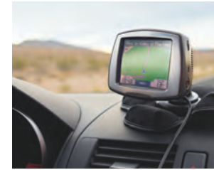
Anchor vehicle accessories to dashboard.