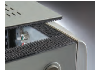
Attach access panels to industrial, electronic and electrical equipment.