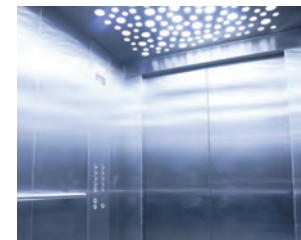
Attach elevator control panel to interior wall.