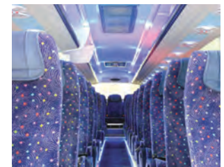
Fasten ceiling panels to interior for future access.