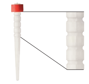
Fig. 3: The coronal macro retention of 3M™ RelyX™ Fiber Post 3D give a high and secure mechanical retention to the core build-up material, immediate depth control and auidance for post shortening.