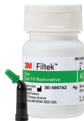
3M™ Filtek™ One Bulk Fill Restorative

And, it helps you deliver predictable, robust outcomes. All you need is the new 3M™ RelyX™ Fiber Post 3D Glass Fiber Post plus three other easy-to-use 3M products: 3M™ RelyX™ Unicem 2 Automix Cement, 3M™ Scotchbond™ Universal Adhesive, and 3M™ Filtek™ One Bulk Fill Restorative. These four products have one common objective: Simplify the complex!