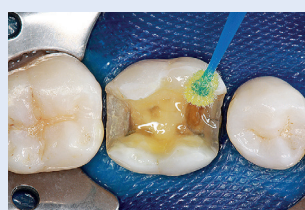
4. Bond with 3M™ Scotchbond™ Universal Adhesive and 3M™ RelyX™ Ultimate Adhesive Resin Cement