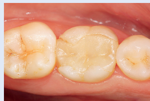
1. Initial situation