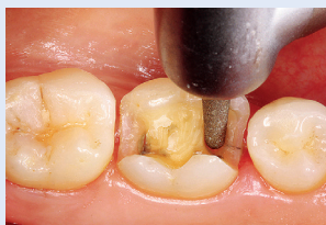
2. Tooth preparation