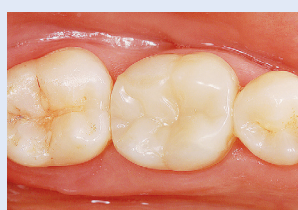
6. Final restoration