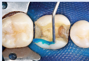
3. Selective etch