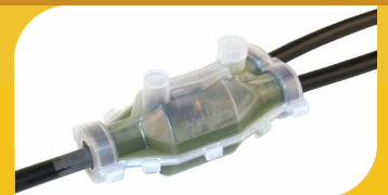
Joint complete when resin has completely filled the mould