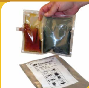
Sealed, two part resin bag

The 3M™ Scotchcast™ Closed Mix-Pour resin system allows mixing and pouring of the two-part resin without exposure to the user. Further, no tools or mixing containers are required.