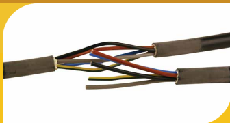
Prepare and connect cables

The 3M™ Scotchcast™ “Express” one-part mould body is now available in inline, T-branch and Y-branch (pictured) configurations.