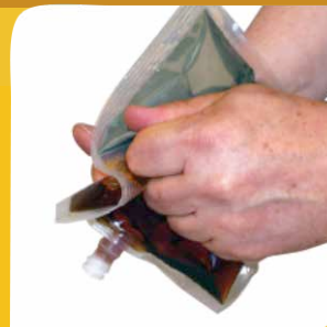
Internal mixing is safe and clean