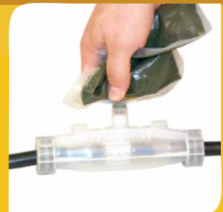
Resin is released and safely poured in one easy step