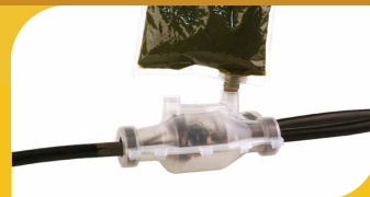
Mix and pour resin