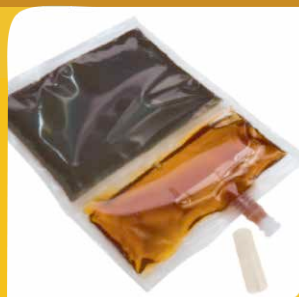
Integrated delivery system. Included nozzle accessory used for LVI-3 series